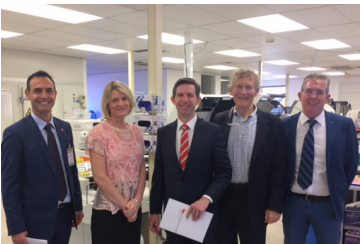
Simon Birmingham visits Abbott Pathology