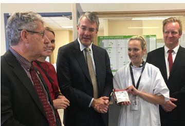
Mark Dreyfus visits Frankston Hospital