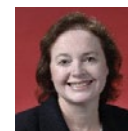
SENATOR CAROL BROWN Australian Labor Party Hobart Pathology, Hobart September 2014