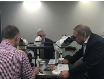
Senator Don Farrell visiting Clinpath lab in Adelaide

Learn about your tests: knowpathology.com.au