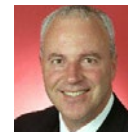
SENATOR GAVIN MARSHALL Australian Labor Party Melbourne Pathology, Melbourne March 2016