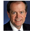
HON BILL SHORTEN MP Australian Labor Party Western Diagnostics, Darwin January 2016