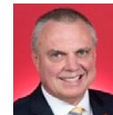
SENATOR STIRLING GRIFF Nick Xenophon Team May 2017 SA Pathology, Adelaide