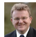
HON BRUCE BILLSON MP Liberal Party of Australia Dorevitch Pathology, Frankston Hospital, August 2015