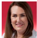
SENATOR DEBORAH O'NEILL Australian Labor Party NSW Health Pathology, Gosford Hospital, October 2015