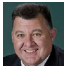
CRAIG KELLY MP Liberal Party of Australia NSW Health Pathology, Liverpool Hospital, October 2016