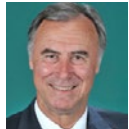
MR JOHN ALEXANDER OAM, MP Liberal Party of Australia DHM Pathology, Macquarie Park May 2015