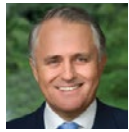
HON MALCOLM TURNBULL MP Liberal Party of Australia Sydpath, St Vincent's Hospital Sydney, September 2015