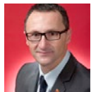
SENATOR RICHARD DI NATALE Australian Greens St John of God, Geelong April 2015