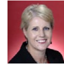
SENATOR CATRYNA BILYK Australian Labor Party Hobart Pathology, Hobart September 2014