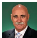
HON WARREN SNOWDON MP Australian Labor Party Western Diagnostics Pathology, Darwin, January 2016