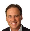
GREG HUNT MP Liberal Party of Australia June 2017 Dorevitch, Frankston Hospital