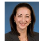
MS GAI BRODTMANN MP Australian Labor Party ACT Pathology, Canberra Hospital, December 2014