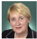
HON JENNY MACKLIN MP Australian Labor Party Austin Pathology, Austin Hospital March 2015