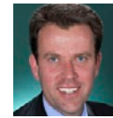
MR DAN TEHAN MP Liberal Party of Australia Dorevitch Pathology, Hamilton Base Hospital, August 2014